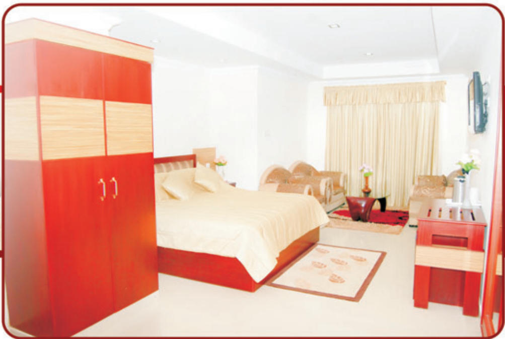
Richly Furnished Rooms