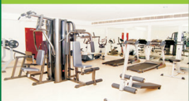
Fully Equipped Gymnasium An ideal fitness centre