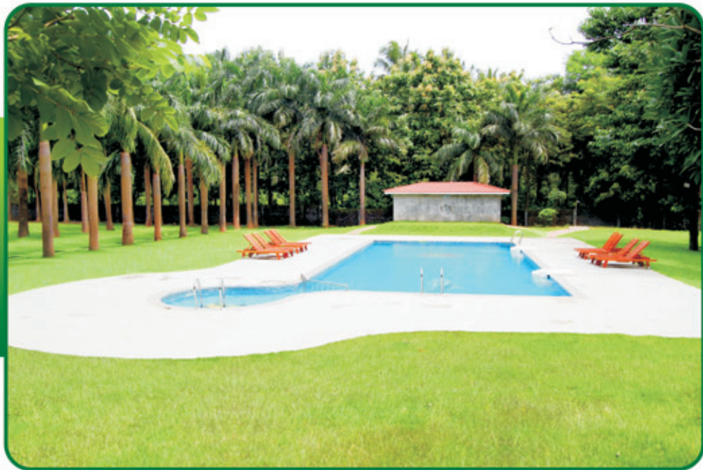
Enchanting Swimming Pool A dip in the crystal clear water will refresh your body and relax your mind